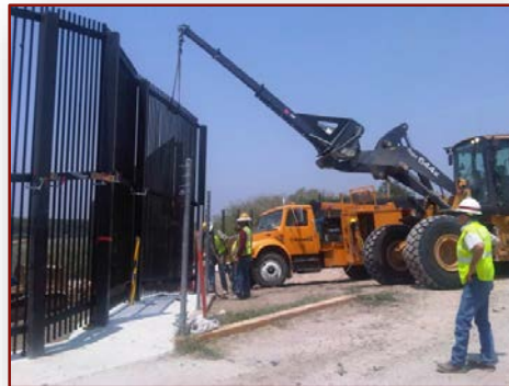
Eagle Pass, Texas, Border Fence Construction