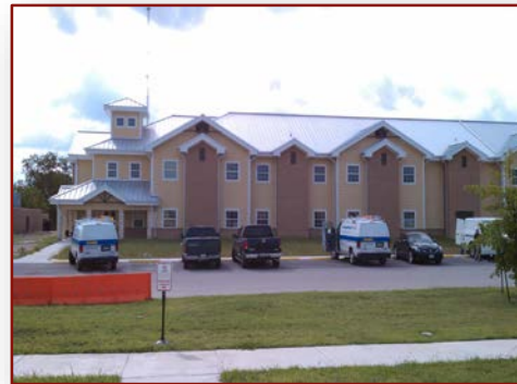
Ajo, Ariz., Border Patrol Station