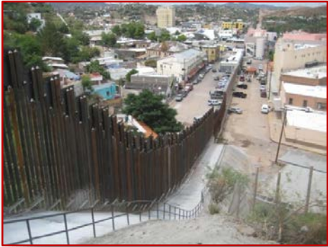
Nogales, Ariz., Border Fence Replacement