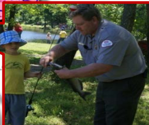
Eufala Lake, Oklahoma