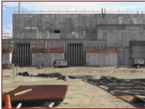
High Explosive Pressing Facility, Pantex Plant, OK