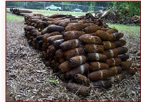
Environmental Restoration- Munitions Removal