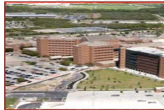
San Antonio Military Medical Center