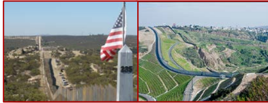
Support to Department of Homeland Security