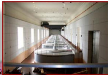
Bull Shoals Powerhouse Arkansas