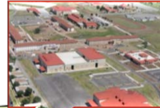
Air Defense Artillery School Fort Sill