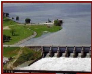
Lake Lavon, Texas