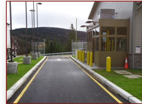
Pittsburg, N.H. Land Point of Entry