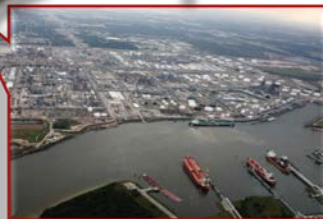
Houston Ship Channel