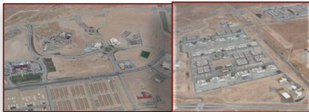
BRAC Program - Fort Bliss